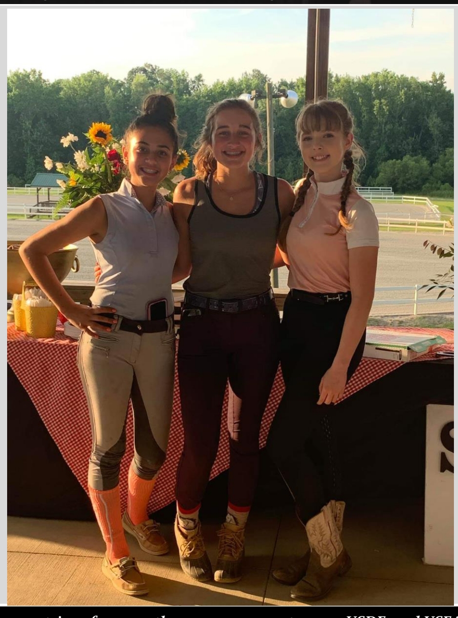
Informing equestrians for more than 40 years, 1979 to 2020. USDF- and USEA-affiliated Group Member Organization. Our members are automatically Group Members of USDF.